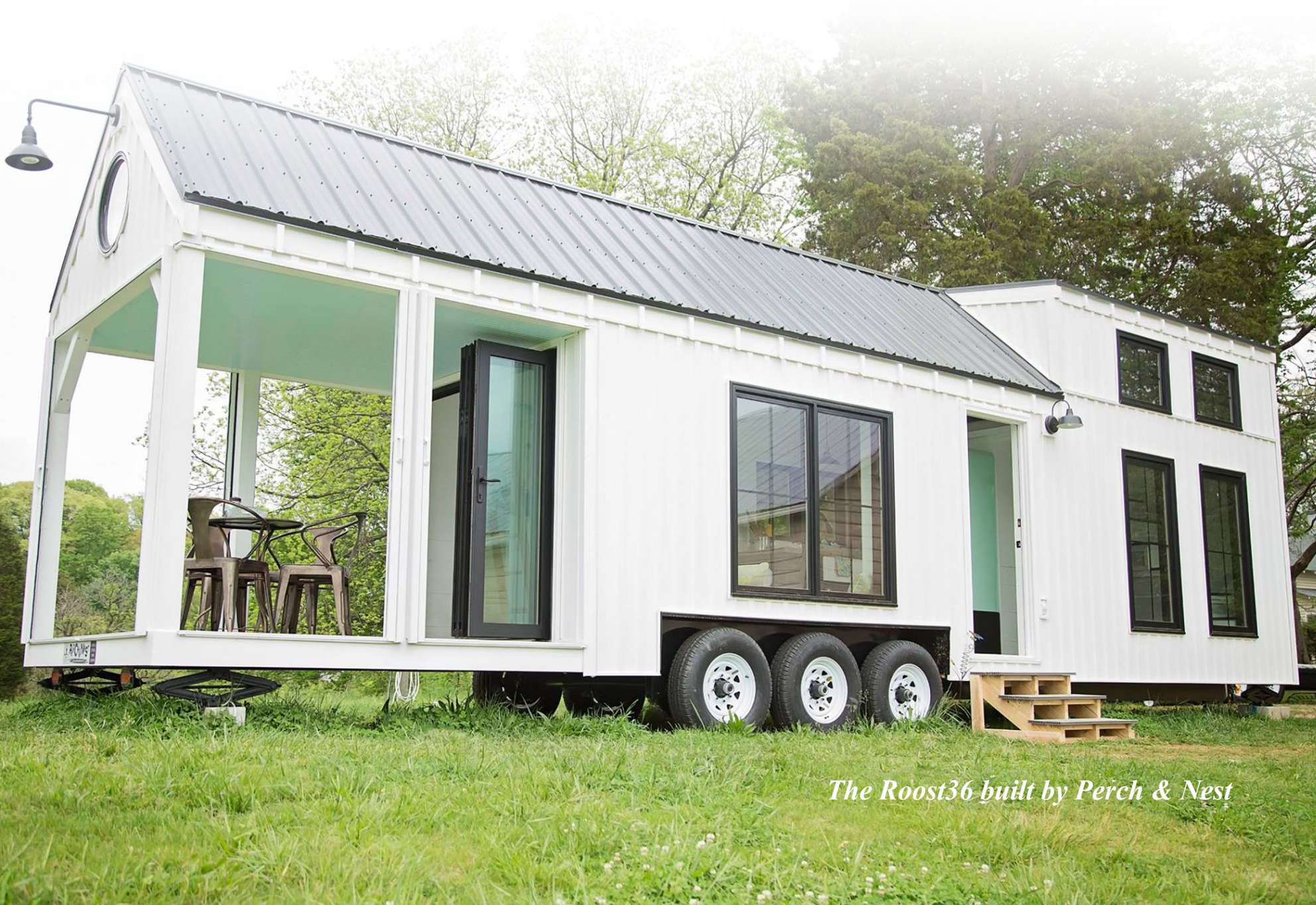
The Roost36 built by Perch & Nest